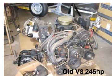
Old V8 245hp

The same performance was achieved with the new Volvo Penta D3 190 DPS with a lot less fuel consumption.