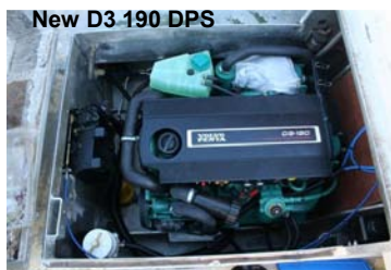
New D3 190 DPS